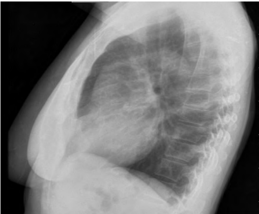
Figure 2. Chest x-ray image in profile, UFU Medical School Clinics Hospital, Brazil, 2021.

submitted to transesophageal echocardiography, which identified a peduncular mass in the basal septum, with irregular edges, and dimensions 4.9 cm × 2.9 cm in the left atrium.